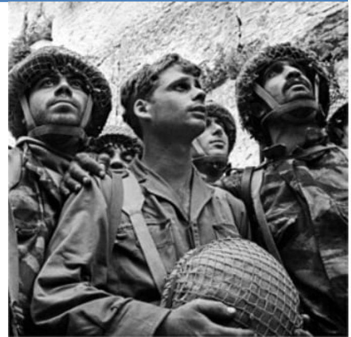
Israeli paratroopers stand in front of the Western Wall in Jerusalem (1967)