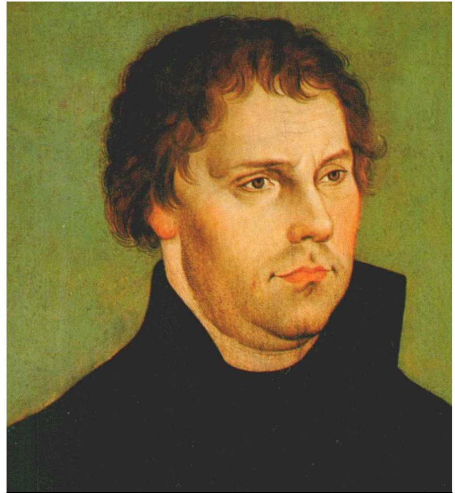
Martin Luther (1483 – 1546)